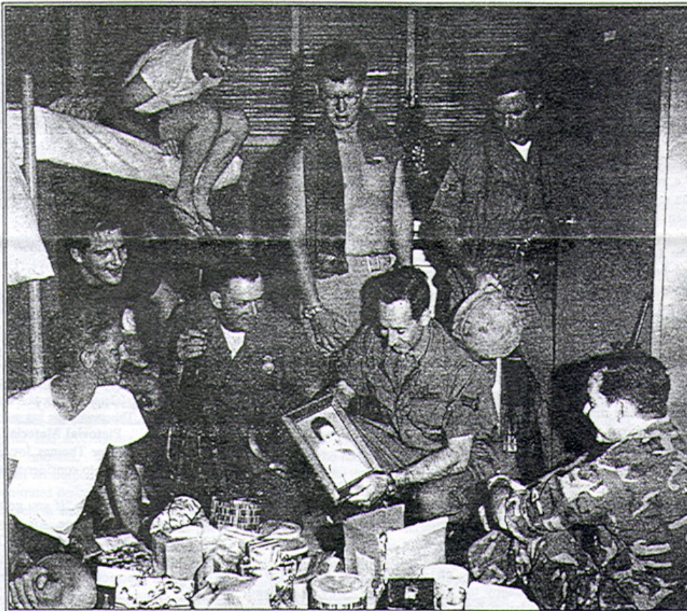
Christmas Eve on Tan Son Nhut, 1967

(Members of the 377th Security Police Squadron are assembled for a 7th Air Force press release.)