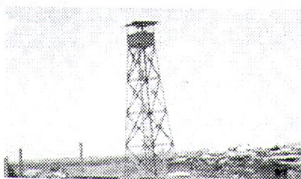
Tango 4 or 5