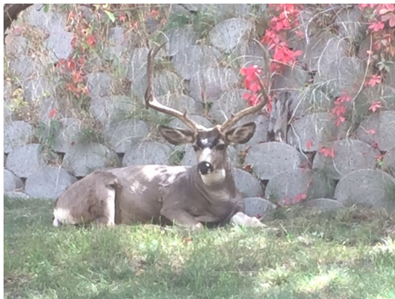
MARRIOTT COLORADO SPRINGS OFFICIAL GREETER (HE CALLED EVERYONE, "Dear . . . . .")