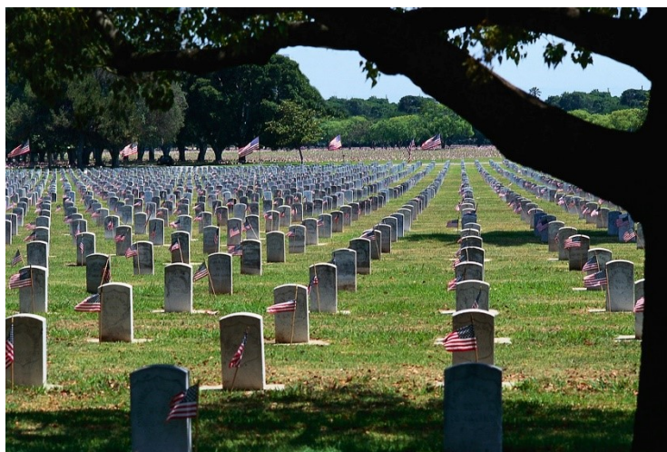
IN MEMORY MEMORIAL DAY, 2012

Memorial Day is a day when we pause to give thanks to the people who fought for the things we have."