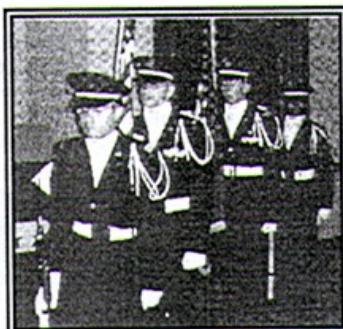
College Park, Maryland, Air Force ROTC cadets sharply post the national colors.