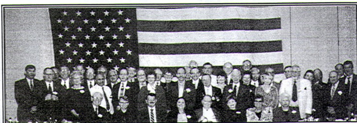
Good bye until next year – we'll see you then!