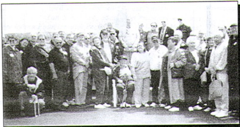
The TSNA Reunion group aboard the Nina's Dandy sailing up the Potomac River. The cruise included a delicious meal and was two and a half hours long. Beautiful warm spring weather, and just about everybody wants to do it again – soon!