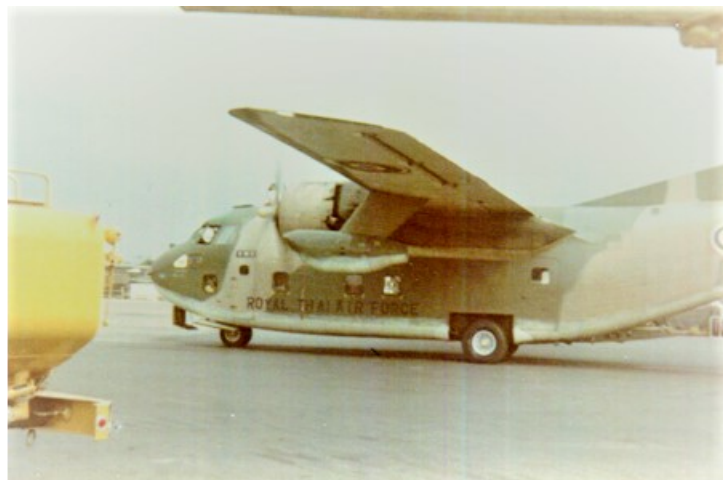
TAN SON NHUT AIR BASE, RVN 1968-1969 ROYAL THAI AIR FORCE C-123